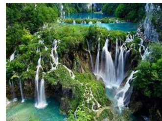
Plitvice Lakes National Park