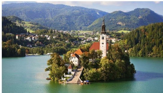
Bled and Bled Island, Slovenia