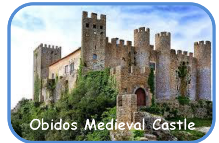
Obidos Medieval Castle