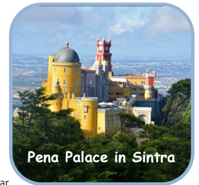
Pena Palace in Sintra