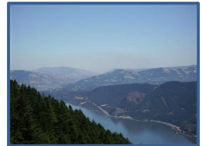
Columbia River Gorge