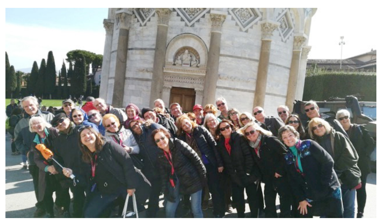
Having fun at the Leaning Tower of Pisa.